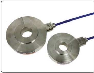
FSG load cells