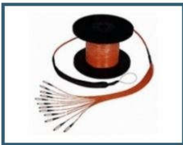
FIBER OPTIC ACCESSORIES