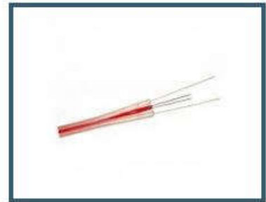
DISTRIBUTED STRAIN SENSORS