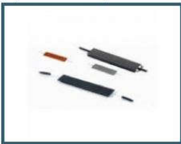
FIBER OPTIC STRAIN SENSORS