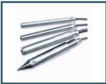
FIBER OPTIC PIEZOMETERS