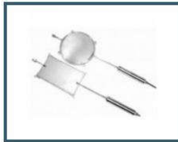
OTHER FIBER OPTIC POINT SENSORS