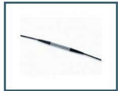
FIBER OPTIC TEMPERATURE SENSORS