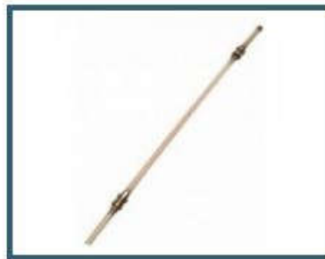
FIBER OPTIC DEFORMATION SENSORS